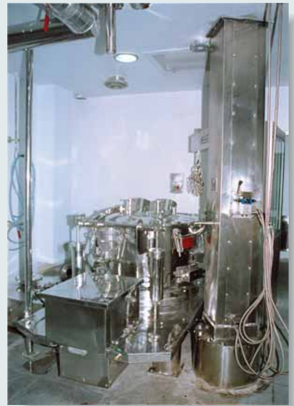
Views of the different sections of the Company's Plant